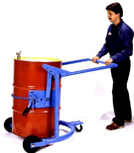
Model 80A shown